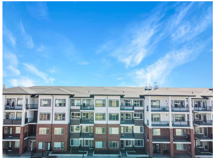
6-3212 Merganser Dr W, Chestermere, AB

Lockwood residents also enjoy exclusive access to a fully equipped fitness centre, an