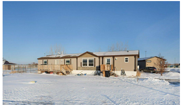
127 Meadowplace Dr E, Brooks, AB

Main Floor Exterior Area 1517.55 sq ft Interior Area 1391.31 sq ft