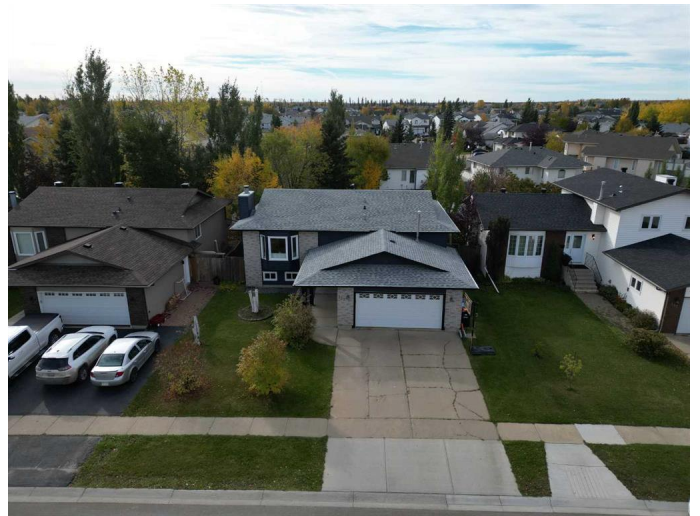
121 Berens Pl, Fort McMurray, AB

Looking for a quiet place to retreat? The primary bedroom is large enough for a king-sized bed, with a big closet and a 3-piece ensuite for extra convenience. The main bathroom has been updated with a renovated